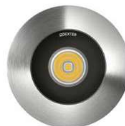
SELENE WIDE 24V