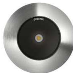
SELENE NARROW 24V