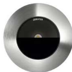
SELENE ASYMMETRIC 24V