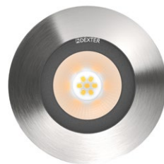
SELENE NARROW 24V