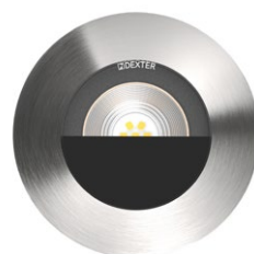
SELENE ASYMMETRIC 24V