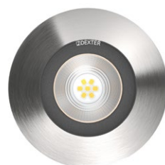
SELENE WIDE 24V