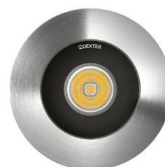
SELENE WIDE 24V