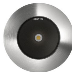
SELENE NARROW 24V