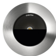
SELENE ASYMMETRIC 24V